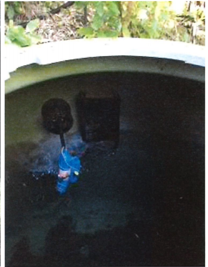
Ballcock inside Tank.