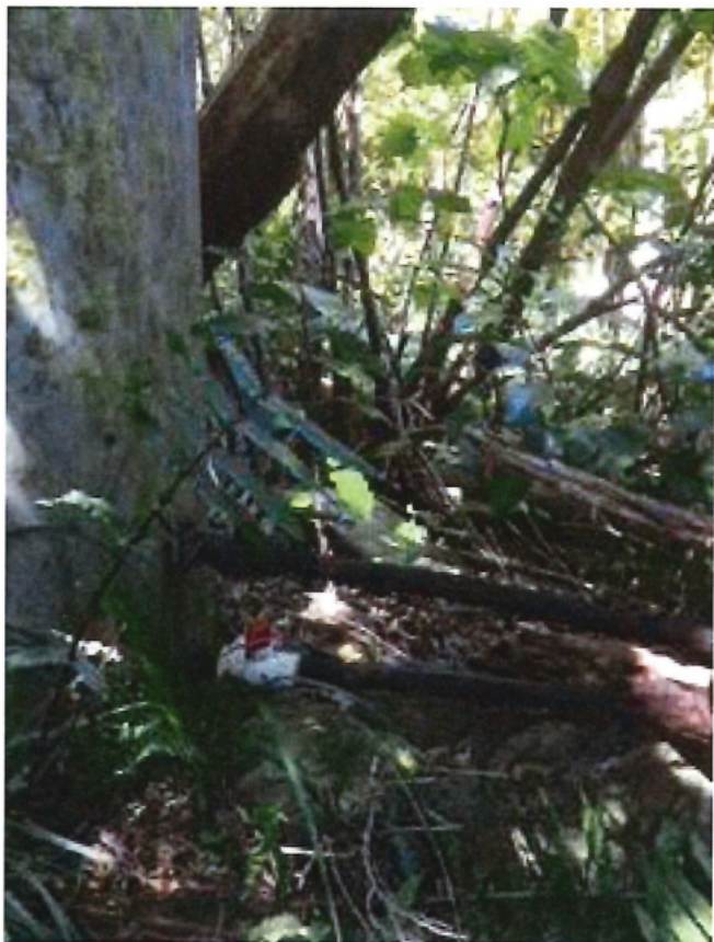
Set outlet Pipes