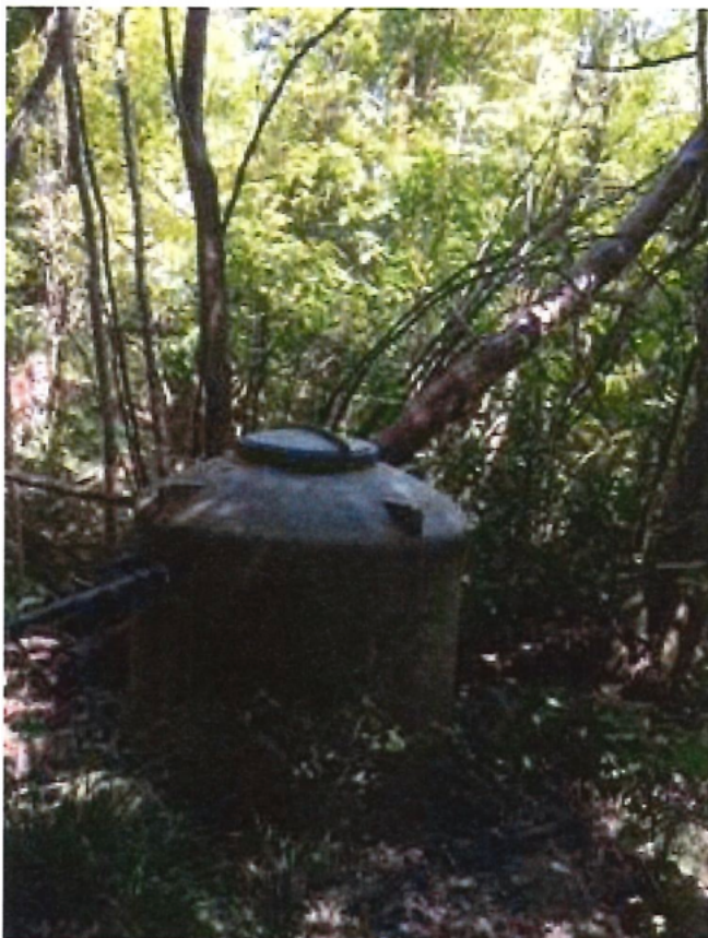
The Tank .