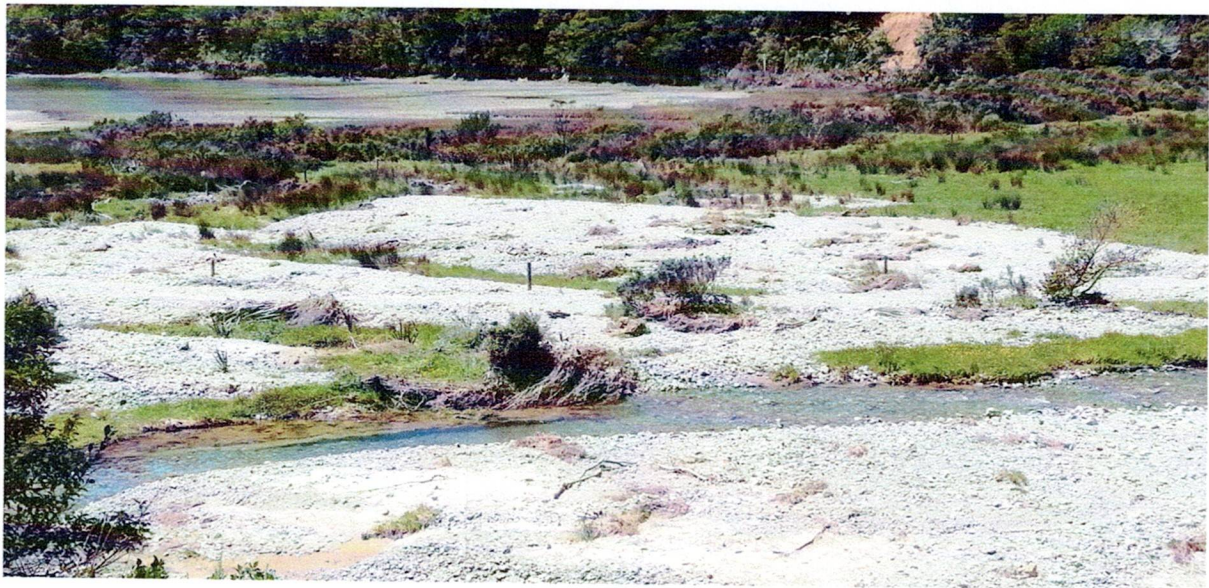
Effect of recent flooding in proposed location of remote transfer station.