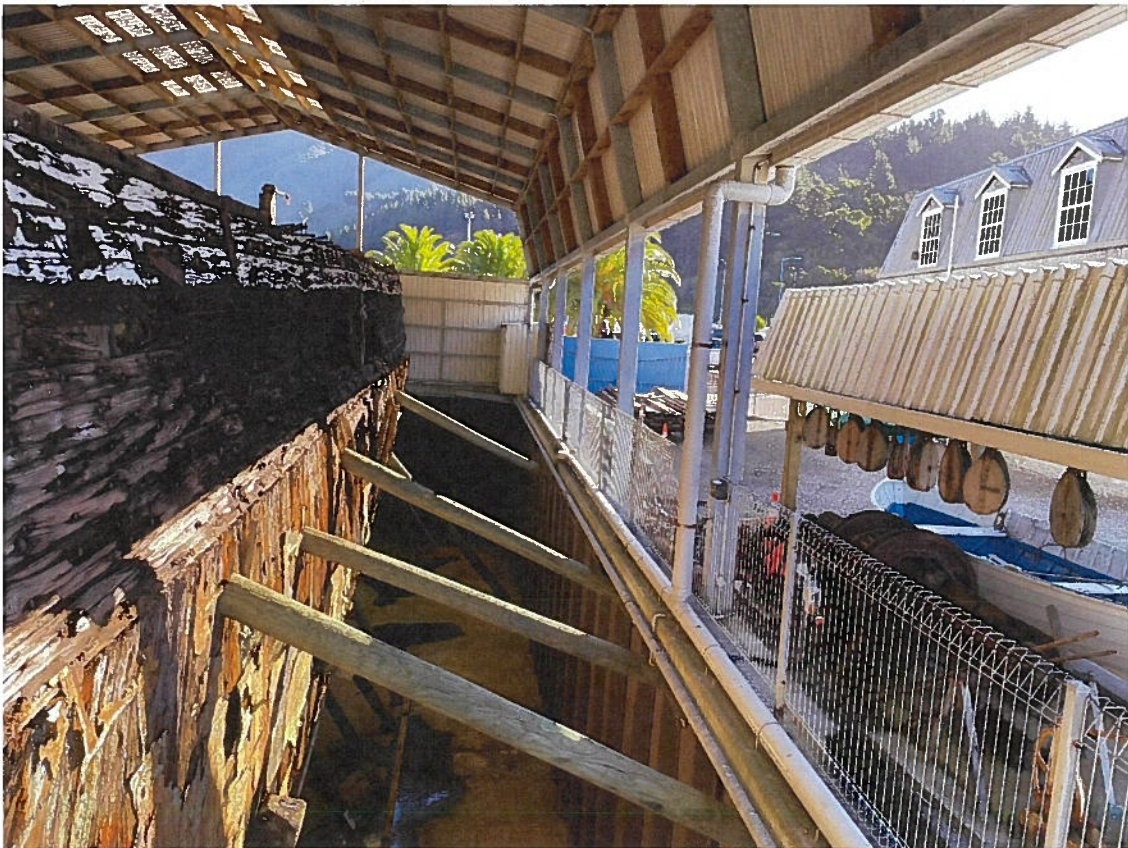
Edwin Fox Downpipes 2022