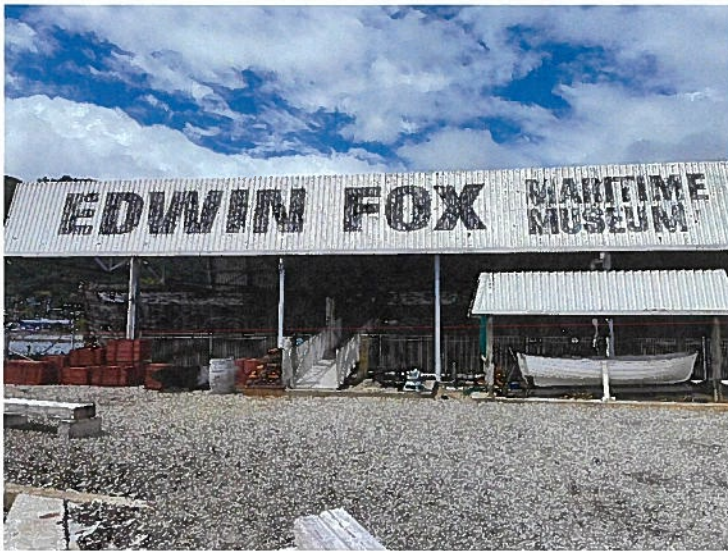
Edwin Fox Dry Dock Roof