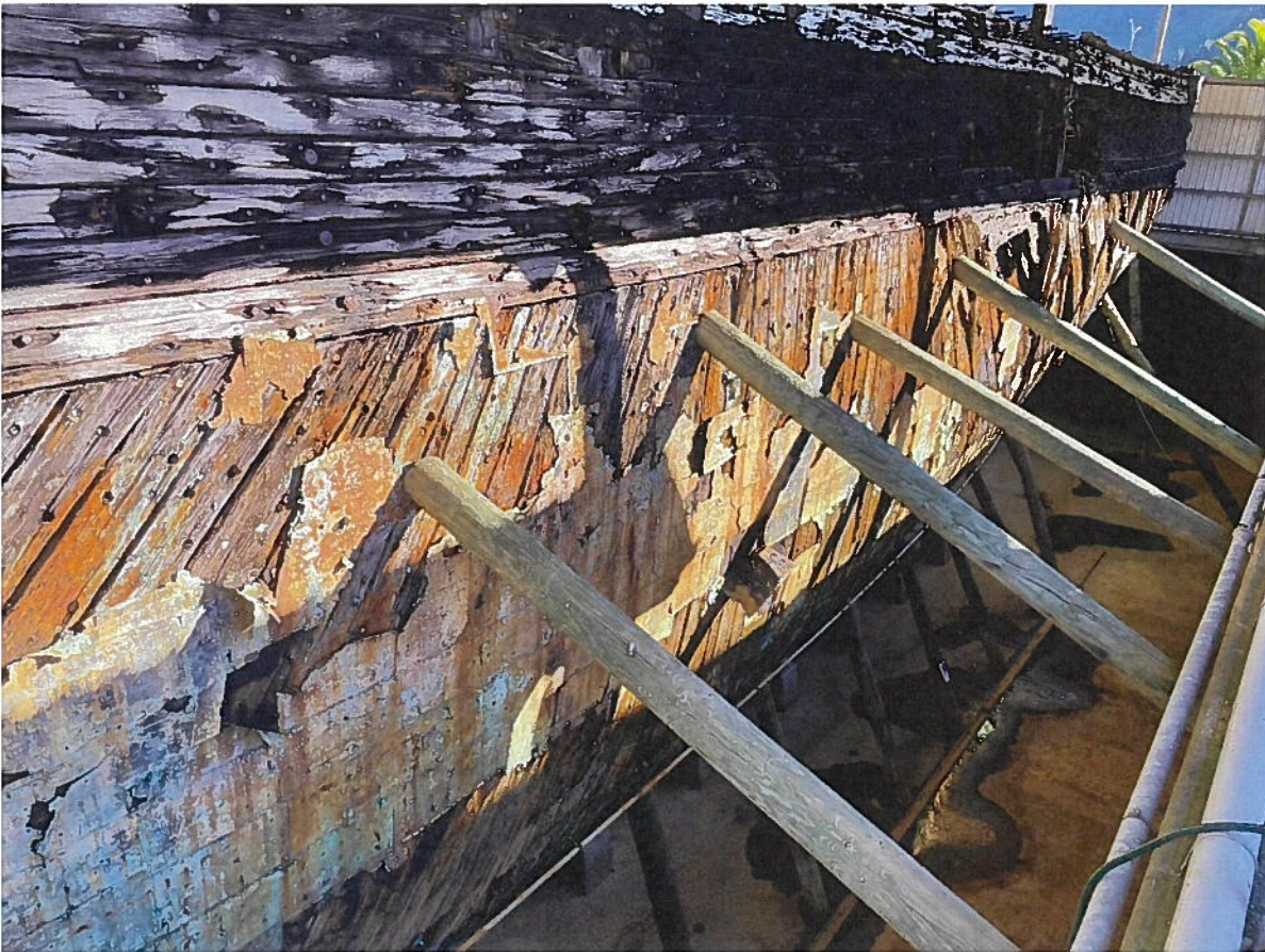
Edwin Fox Sprinklers