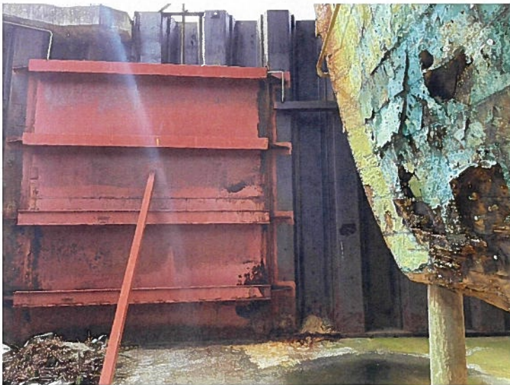
Edwin Fox Dry Dock