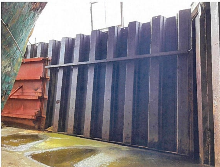
Edwin Fox Dry Dock