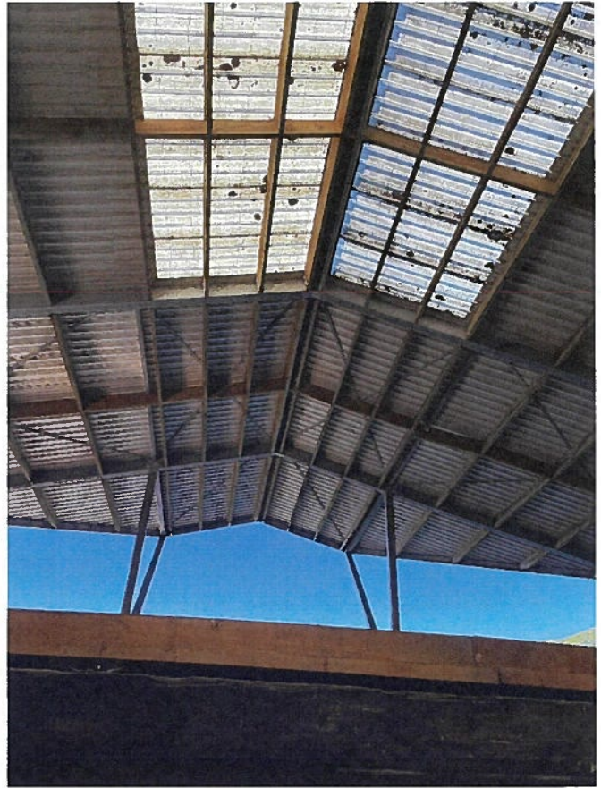
Edwin Fox Roof