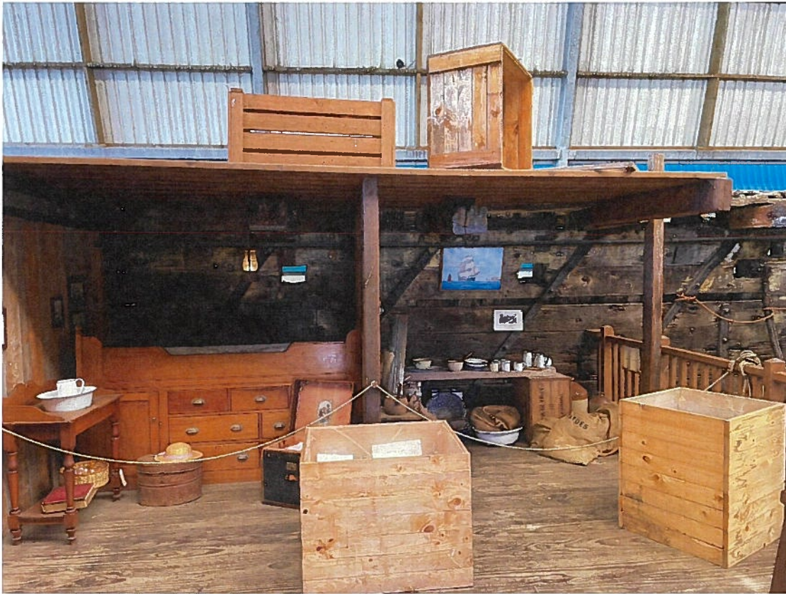
Edwin Fox Cabins 2022